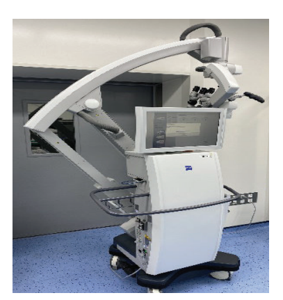
Surgical microscope Pentero P800 - Zeiss.